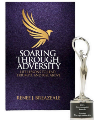
2023 Communicator Award of Distinction Inspirational Speaker